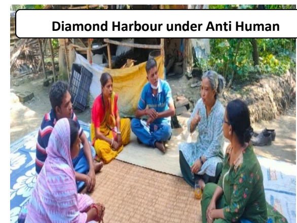
Diamond Harbour under Anti Human