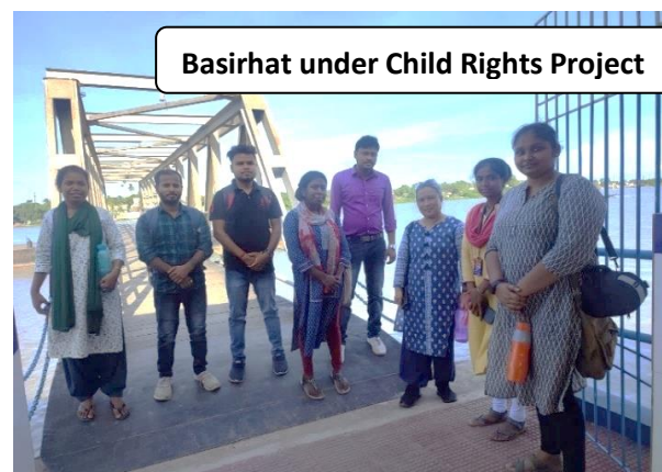
Basirhat under Child Rights Project