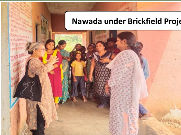
Nawada under Brickfield Project