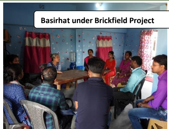
Basirhat under Brickfield Project