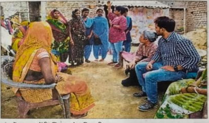
गांव में जाकर मॉनीटरिंग करते अधिकारी।

ईट भट्टा पर काम करने वाले अभिभावकों के बच्चे स्कूलों से जुड़ कर नियमित पढ़ाई कर सकें इसके लिए विशेष अभियान चलाया जा रहा है। जिले में 577 ईट भट्टे से लौटे अभिभावकों के बच्चों को स्कूलों शिक्षा से जोड़ कर उन्हें शिक्षित किया जा रहा है। ईट भट्टे से लौटे बच्चियों के स्वास्थ्य, शिक्षा आदि की मॉनीटरिंग शिक्षा विभाग द्वारा लगातार की जा रही है। बिहार शिक्षा परियोजना के साथ ही कोलकाता मेरी वाई सोशल सेंटर की मदद से संस्थान में विद्यार्थियों के शैक्षणिक और स्वास्थ्य संबंधित जानकारी इकट्ठा किया जा रहा है। जिले के विभिन्न स्कूलों में नामांकन लेने वाले ईट भट्टे से लौटे 577 विद्यार्थियों को शिक्षा की मुख्यधारा से जोड़ा गया है। ईट भट्टे से लौटने वाले विद्यार्थियों को पढ़ाने के लिए विशेष रूप से संबंधित स्कूलों के शिक्षकों को ट्रेनिंग दी गयी है। शिक्षकों को प्रशिक्षण के दौरान यह बताया गया कि ईट भट्टा पर काम करने वाले अभिभावकों के बच्चे शिक्षा से नहीं जुड़ पायें हैं। स्कूल में पढ़ाई के साथ ही उन्हें नये माहौल में रहते हुए स्कूल अवधि में समय बिताना है। इस दौरान उन्हें किसी