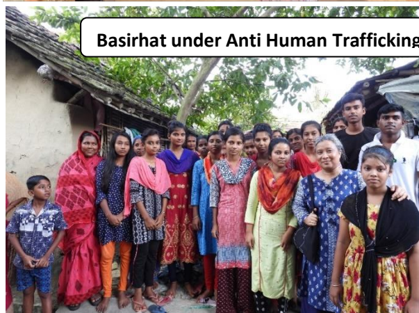
Basirhat under Anti Human Trafficking