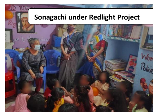
Sonagachi under Redlight Project