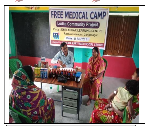
Free health check-up camp