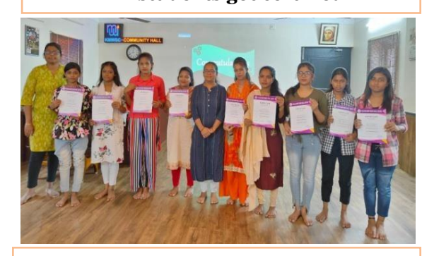
Therapy Sessions/ Motivational Sessions