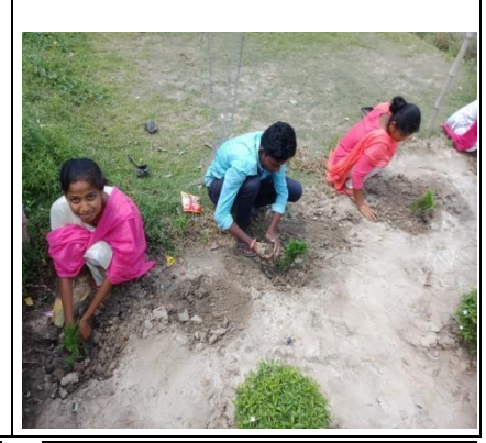
Celebration of Environment Day