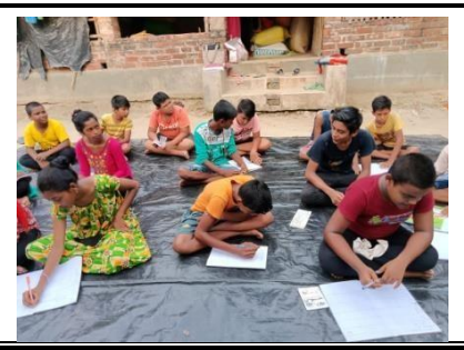
Capacity Building Training of ICDS