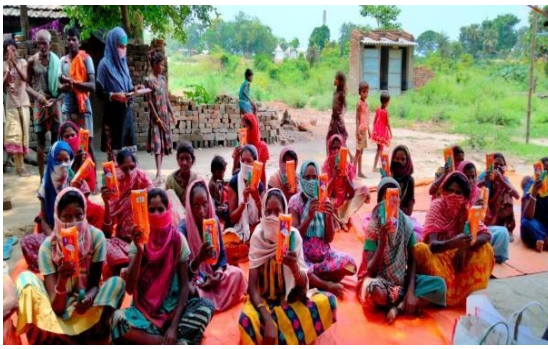
Activities at a glance (Diamond & Basirhat)