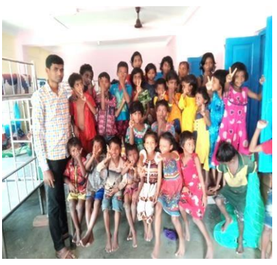
Admission of children in hostels