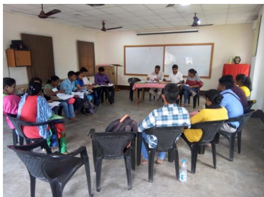
Leading teachers meeting