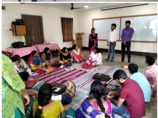
Life skill training for teachers