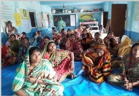
Joy of going to school.....

The parents' meeting was conducted on 29 th October 2018 at Lodha Learning centre. There were total 50 (Male 2 female 48) participants. The main discussion was on distribution of clothes, Annual exams of Children in the month of November 2018 and for enrolment of Lodha Children at Patharpratima Hostel.